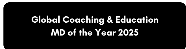
Managing Director of the Year Awards 2025 SME News & AI Global Media