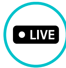
Weekly Live Sessions